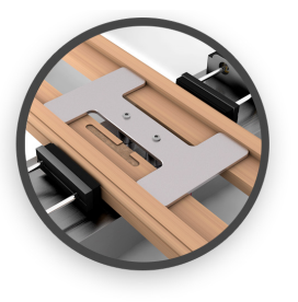
OPTION B: H shaped stop Specific for hinges. More precision working on top of the clamp.

OPTION A: Standar stop More options working on the side of the clamp.